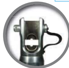
Die sets 95 > 1000 mm 2